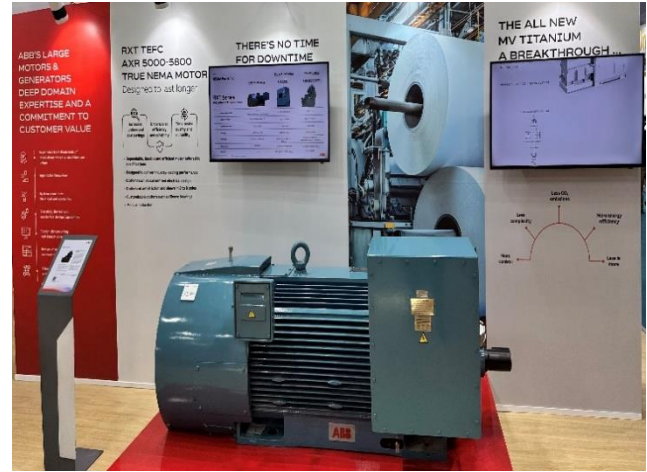
ABB IE 4 Flameproof Motors