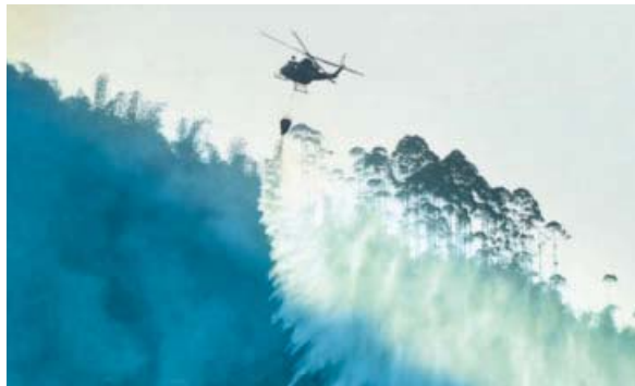
A helicopter works to put out wildfire in a forest in Chongqing

Rainfall in Chongqing this year is down 60 per cent compared to the seasonal norm, and the soil in several districts is severely short of moisture, CCTV said, citing local govern-