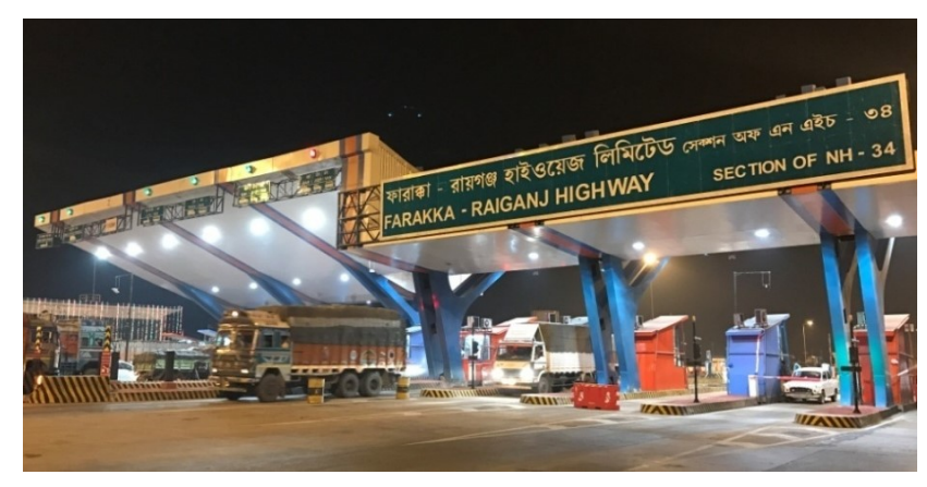
Farakka Raiganj Highway: Toll Plaza at Km 297