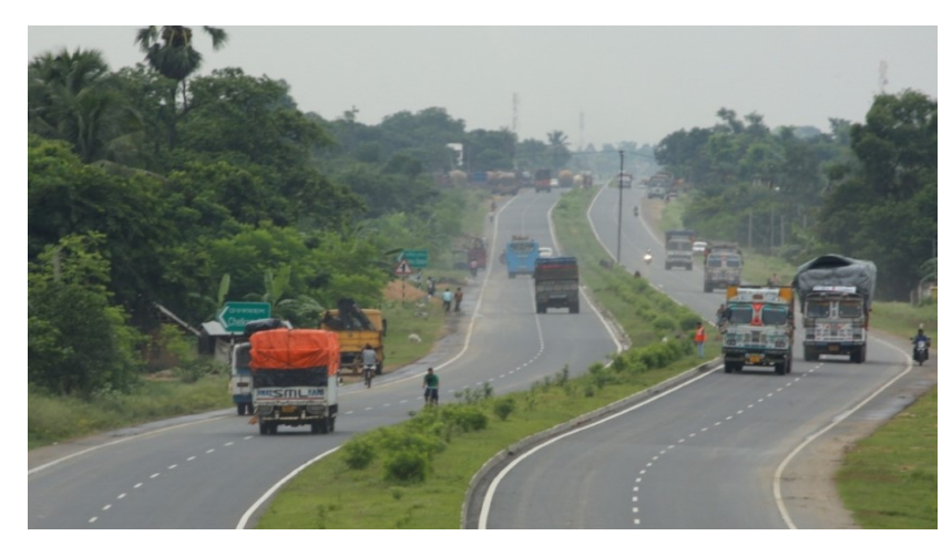
Km 341 (Farakka Raiganj Highway)