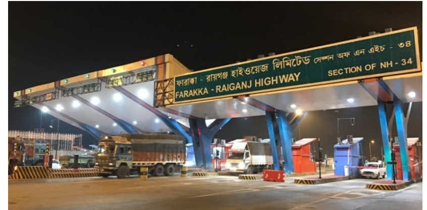
Farakka Raiganj Highway: Toll Plaza at Km 297