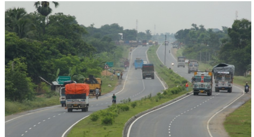
Km 341 (Farakka Raiganj Highway)