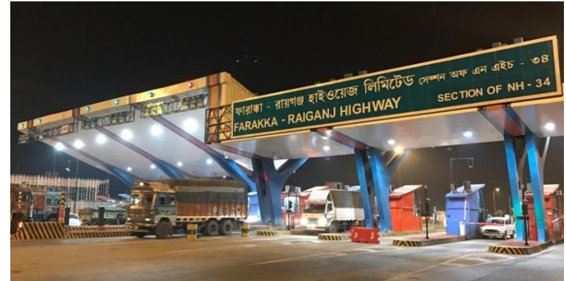
Farakka Raiganj Highway: Toll Plaza at Km 297